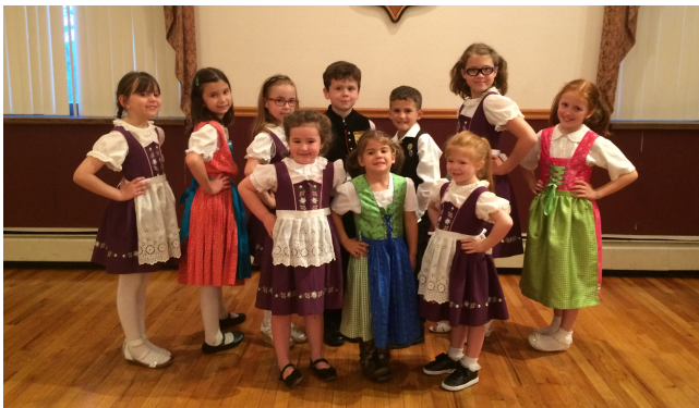
Kindergruppe at the Mother's Day Dinner

A goulash lunch will be held at the club after the Pilgrimage Mass starting around 1:00 p.m. Cost is $15. Please call the club for reservations.