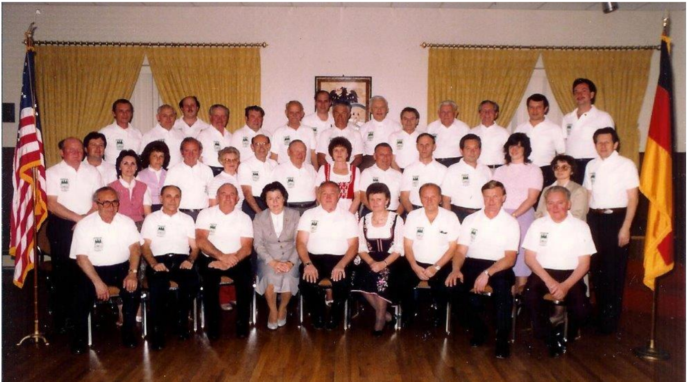
1986 Donauschwaben Board