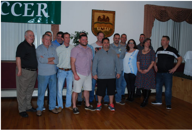
Parents, coaches, and volunteers at the Danubia Soccer Club banquet

Union Game - Danubia moms with Union moms played against our youth Danubia teams at halftime during the Philadelphia Union vs. Houston Dynamo game on May 16. The kids won the game 1-0 and had the experience of a lifetime playing in front of twenty-thousand fans. Photos can be seen at www.philadelphiaunion.com .