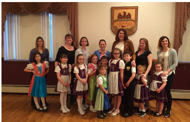
Members of the Kindergruppe with their mothers

We celebrated our Mothers, Omas, and Grandmothers with our Mother's Day dinner. This year, we celebrated during the Friday night dinner. The event had a nice turnout. There was delicious soup, dinner, and dessert. The Kindergruppe performed with 5 couples. They performed 4 dances, including one with their mothers. The children also recited a poem. Each mother in attendance received a flower from the children. Everyone enjoyed celebrating the different mothers in their lives!