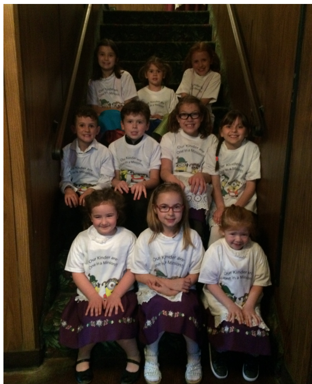
Celebrating at the Mother's Day dinner