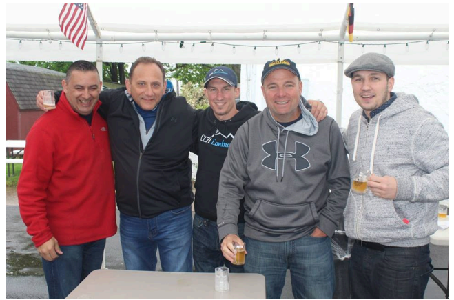
Tasting some German and domestic beers at Danubia Beer Festival

multiple large tents, the crowd was under cover and judging from all the bratwurst that were eaten and the party continuing at the bar inside after the event, everyone had a fun time. We hope to see you again next year!