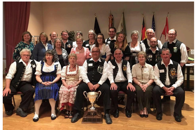
2017-2018 Donauschwaben Landesverband USA Board of Directors

To learn more about the Landesverband der Donauschwaben, please visit www.donauschwabenusa.org .