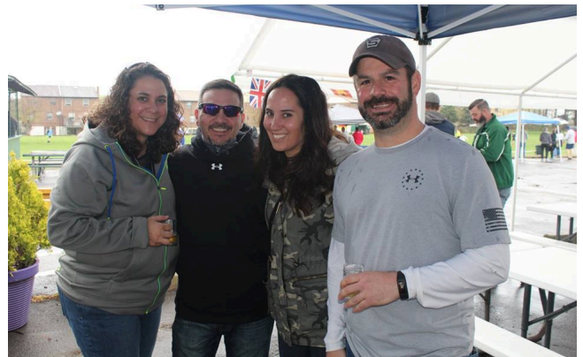
The rain did not dampen their spirits!