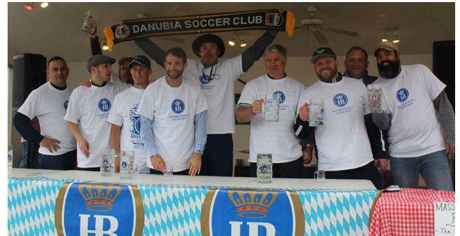
Participants celebrating after the Masskrugstemmen Competition