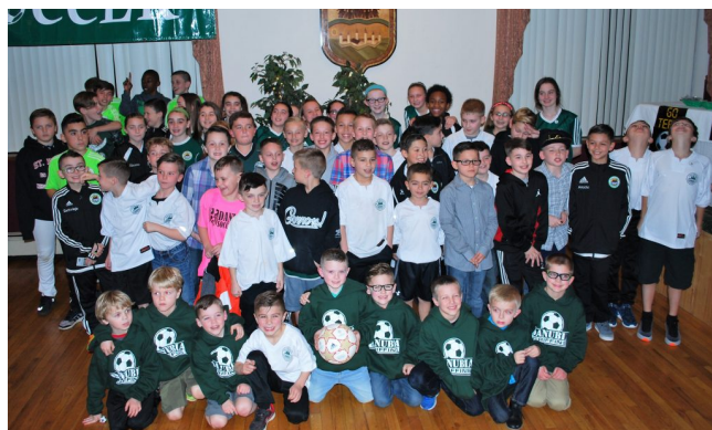
Players celebrating at the Danubia Soccer Club banquet held in February

Banquet - The youth soccer program was able to celebrate our players in our first (annual) youth soccer banquet on February 25, 2017. Parents, players, and coaches had a great time honoring the hard work and successes of each of the teams: U8 Boys Griffins, U9 Boys Gunnars, U10 Boys Cosmos, U11 Boys Hotspur, U12 Boys Celtic, U13 Boys Eagles, and U13 Girls Dynamo.