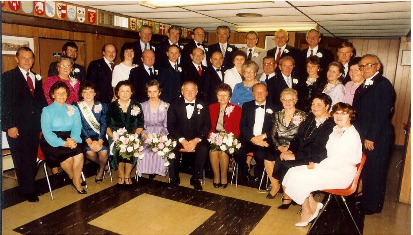
Some of the 1986 Board Members with their Spouses at the Yearly Banquet