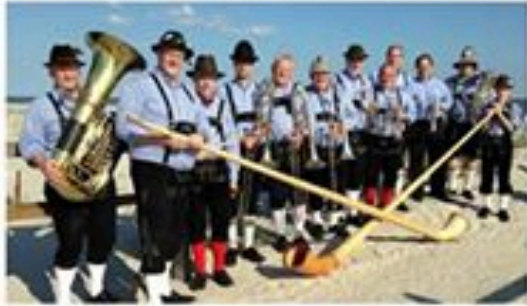
Philadelphia German Brass Band