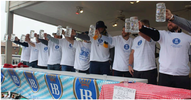
Masskrugstemmen Competition sponsored by Hofbräu