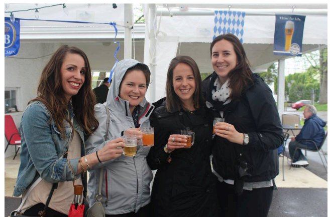
Enjoying the afternoon at Danubia Beer Festival