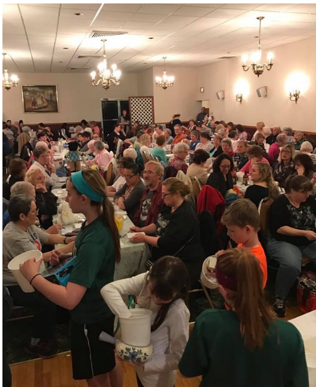
A full house at this year's Penny Party!

Hope to see everyone there again. Please, tell your friends about it, and we can all have a good time again next year.