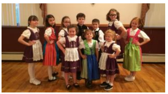
2017 Philadelphia Donauschwaben Kindergruppe

As always, we welcome you to contribute to our future newsletter issues by sending an email to newsletter@danubeswabian.com or by talking with a club representative. Have a great rest of your summer!