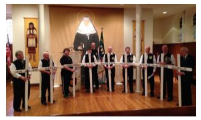
Club members carry crosses representing each of the death camps