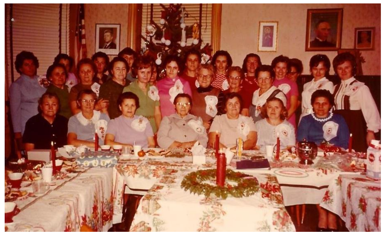
Donauschwaben Ladies Christmas Party and Luncheon in the Kolping House taken in 1971 before the Club House was built