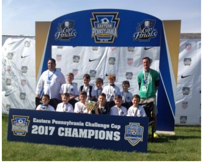
Danubia Soccer Club teams celebrate their championship victory

https://northeasttimes.com/danubia-soccerclub-brings-home-two-state-championships-5df54ede20cd